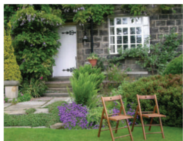
York Gate Garden, Leeds